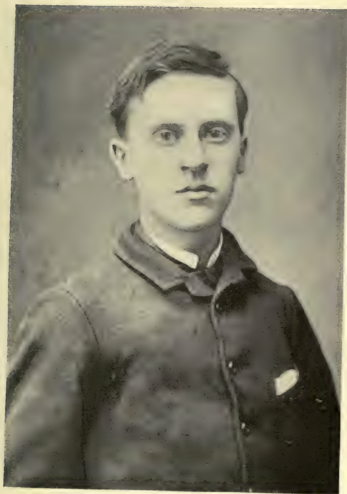
Romain Rolland at the Normal School